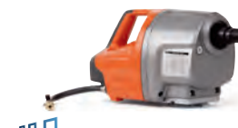
PRIME ELECTRIC-POWERED HUSQVARNA DM 700 6000/3000W, 3-phase/1-phase, recommended drill diameter 80–600 mm, 14 kg.