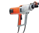
ELECTRIC-POWERED HUSQVARNA DM 230 1850W, 1-phase, recommended drill diameter 150 mm, handheld 80 mm, 7 kg.