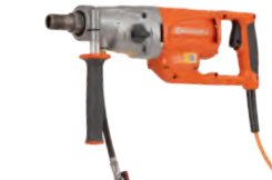
ELECTRIC-POWERED HUSQVARNA DM 200 2000W, 1-phase, recommended drill diameter 25–100 mm, 6.4 kg.