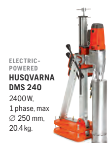
ELECTRIC-POWERED HUSQVARNA DMS 240 2400W, 1 phase, max Ø 250 mm, 20.4 kg.