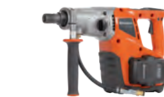
BATTERY-POWERED HUSQVARNA DM 540i 1350W, recommended drill diameter 15–75 mm (100 mm with drill stand), 4.9kg. BLi 36V battery system.