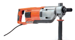
ELECTRIC-POWERED HUSQVARNA DM 220 1850W, 1-phase, recommended drill diameter 150 mm, handheld 80 mm, 7.5 kg.