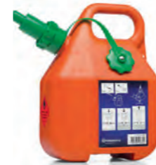
FUEL CAN Our range of accessories also includes our in-house developed petrol can, which holds 6 l and is fitted with an effective level control.