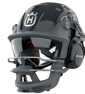
HUSQVARNA SMARTGUARD™ HELMET PE 10 H Sturdy yet lightweight with a special chin guard to increase protection of the operator's face. Complete with visor and hearing protection, with room for anti-dust mask and personal eye protection.