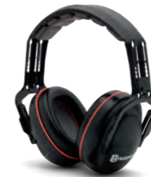
HEARING PROTECTION WITH FM RADIO Good sound quality and comfortable fit. Equipped with 3.5 mm audio input (AUX) for music player and communication radio. Versions available with headband or helmet mount.