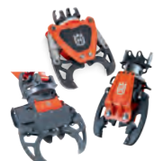
HUSQVARNA DCR 500, DCR 100 AND DCR 90 With these powerful crushers you can easily crush a 270–465 mm-thick concrete wall, staircases and pillars, etc.