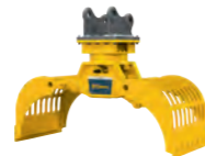
HUSQVARNA MG 200 AND MG 100 Multi-grapples that offer low operating weight with high gripping volume.