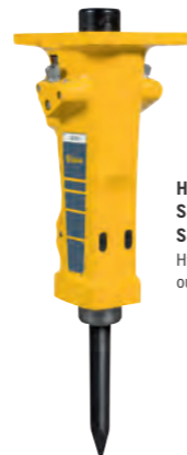
HUSQVARNA SB 302, SB 202, SB 152, SB 102 AND SB 52 Hydraulic breakers with outstanding knocking force.