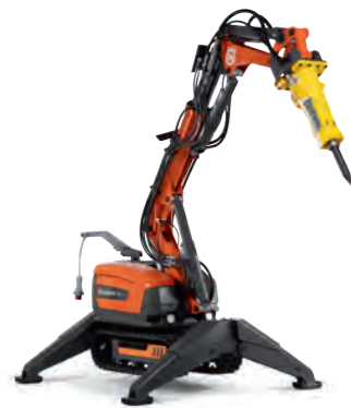
HYDRAULIC-POWERED HUSQVARNA DXR 315 27 kW, 2020 kg, reach 5.5/5.2 m up/forward incl. tool.

As an expert on controlled demolition, you know exactly how to get the job done – and our solutions let you do it smarter, with better performance and new levels of power. Explore what you can accomplish with the DXR demolition robots from Husqvarna. Get ready to experience unstoppable power and meticulous control like you've never done before.