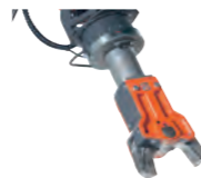
HUSQVARNA DSS 200 Steel shearer for demolishing structures, piping, process vessels and tanks. Ideal in sensitive areas such as process industries. For Husqvarna DXR 315, DXR 305, DXR 275 and DXR 145.