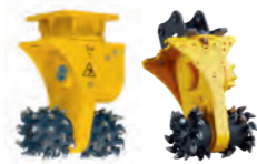
HUSQVARNA ER 50 AND ER 40 Highly productive rotary drum cutters for trenching, surface removal and profiling in rock, concrete and hard soil.