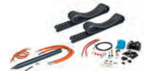
HEAT PROTECTION KIT Enables work in hot applications by protecting vital parts from damage by radiant and conduction heating.