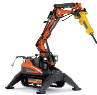
PETROL-POWERED HUSQVARNA DXR 145 18.5 kW, 985 kg, reach 4.4/3.7 m up/forward incl. tool.