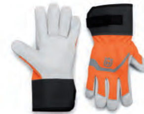
GLOVES, CLASSIC A one-size durable glove made with a goat leather palm and spandex fabric on the back. Rubberised cuff with cotton binding for a perfect fit around the wrist.