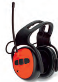
HEARING PROTECTION WITH HEADBAND Comfortable and lightweight with a flexible padded headband. Design allows for a 20% adjustment of pressure. Approved according to current EN standards.