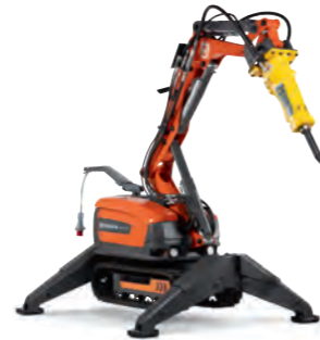
HYDRAULIC-POWERED HUSQVARNA DXR 275 24 kW, 1750 kg, reach 4.8/4.5 m up/forward incl. tool.