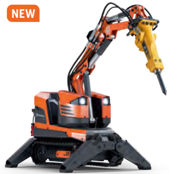
HYDRAULIC-POWERED HUSQVARNA DXR 95 9.8 kW, 589 kg, reach 3.2/2.7 m up/forward incl. tool.