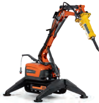
HYDRAULIC-POWERED HUSQVARNA DXR 305 27 kW, 1960 kg, reach 5.2/4.9 m up/forward incl. tool.