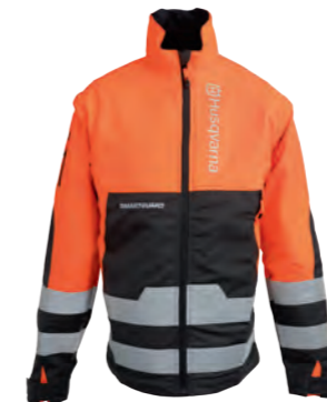
HUSQVARNA SMARTGUARD™ JACKET PE 10 J Sturdy and comfortable protective jacket made with reinforced material to increase protection of the operator's neck and chest. High visibility according to EN20471 class 2. Removable sleeves, smart pockets and ventilation. Size S–XXL.