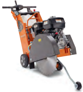
HUSQVARNA FS 400 LV Diamond blade max 450/500 mm, cutting depth 162/189 mm, 99/120 kg, 8.7 kW*.

Diamond blade max 600/500 mm, cutting depth 241/179 mm, 231/197. FS 524, petrol, 15.5 kW*. FS 513, petrol, 8.7 kW*.