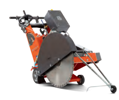
ELECTRIC-POWERED HUSQVARNA FS 600 E/FS 500 E

Diamond blade max 900 mm, 680–695 kg, cutting depth 381 mm. 35 kW*.