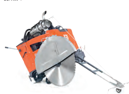
ELECTROHYDRAULIC-POWERE HUSQVARNA FS 5000 D

Diamond blade max 1500 mm, 1338 kg, cutting depth 625 mm, 55.4\,\mathrm{kW}^* .