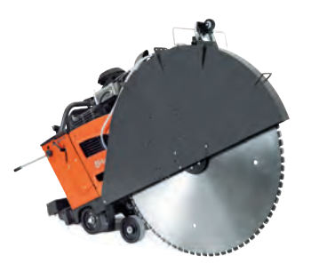
ELECTROHYDRAULIC-POWERED HUSQVARNA FS 7000 DL

Diamond blade max 1500 mm, 1338 kg, cutting depth 625 mm, 55.4\,\mathrm{kW}^* .