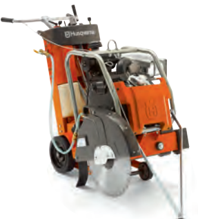
PETROL- / ELECTRIC-POWERED HUSQVARNA FS 500 SERIES

Diamond blade max 750 mm, 419 kg, cutting depth 311 mm, 27.5 kW *.