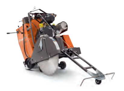
ELECTROHYDRAULIC-POWERED HUSQVARNA FS 3500 EFI G

Diamond blade max 900 mm, 771 kg, cutting depth 374 mm, 35.5 kW*