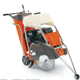
DIESEL- / PETROL-POWERED HUSOVARNA FS 400 SERIES

Diamond blade max 600/500 mm, cutting depth 240/192 mm, 178/145 kg, 7.5 kW *.