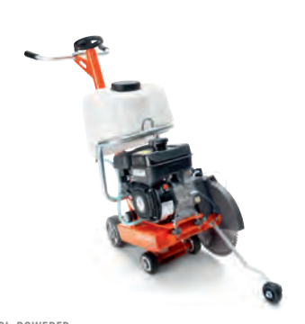
HUSQVARNA FS 300 SERIES

Diamond blade max 500 mm, cutting depth 189 mm, 163 kg. FS 413, petrol, 8.7 kW*. FS 410 D, diesel, 6.6 kW*.