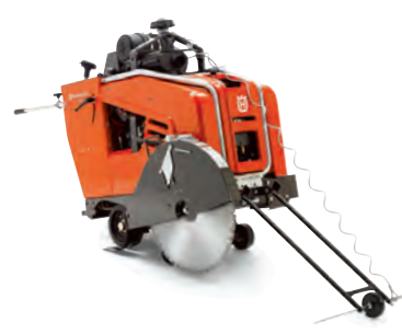
ELECTROHYDRAULIC-POWERED HUSQVARNA FS 4800 D

Diamond blade max 1000 mm, 1032kg, cutting depth 411 mm, 55.4kW*