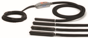
ELECTRIC-POWERED HUSQVARNA SMART VIBRATORS 1-phase, \varnothing 40–65mm, hose length 5, 8, 10m, 13.1–18.5kg.