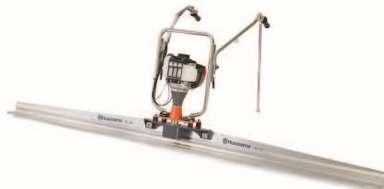
PETROL-POWERED HUSQVARNA BV 30 1kW, centrifugal clutch, 14kg.