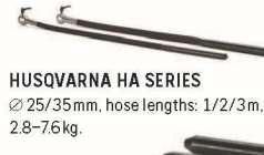
HUSQVARNA HA SERIES \varnothing 25/35mm, hose lengths: 1/2/3m, 2.8–7.6kg.