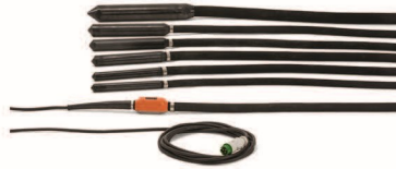
ELECTRIC-POWERED HUSQVARNA SMART-E VIBRATORS 1-phase, \varnothing 40–56mm, hose length 0.5m, 12–14.8kg.