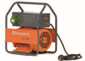
ELECTRIC-POWERED HUSQVARNA CF 11 Output 42V–3–200Hz, 0.8kVA, 11A, 18kg, 1 outlet.