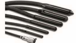
PNEUMATIC-POWERED HUSQVARNA AY SERIES 7 diameters, 26–155mm, hose length 2 or 4m, 4–28kg.