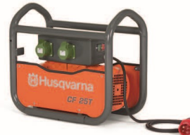
ELECTRIC-POWERED HUSQVARNA CF 25 Output 42V–3–200Hz, 1.8kVA, 25A, 31kg, 2 outlets.