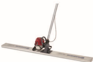
PETROL-POWERED HUSQVARNA BV 20 G 2m, 0.7kW, 16.6kg.