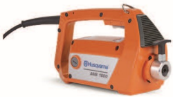
ELECTRIC-POWERED HUSQVARNA AME 1600 1-phase, 1.6kW, 6.1kg.