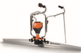
BATTERY-POWERED HUSQVARNA BV 30i Output power 0.8kW, weight 11.5kg, BLi 36V battery system.