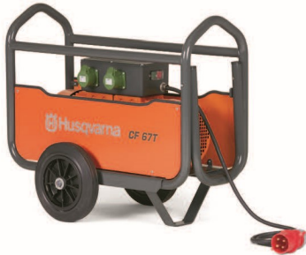
ELECTRIC-POWERED HUSQVARNA CF 67T Output 42V–3–200Hz, 4.7kVA, 67A, 70kg, 4 outlets.