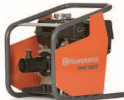
PETROL-POWERED HUSQVARNA AMG 3200 Drive unit for AA and AZ vibrators, 2.8kW, 15kg.