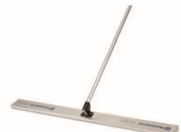
HUSQVARNA BV 20 H 2.0m, 7.5kg.