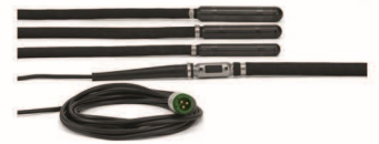
ELECTRIC-POWERED HUSQVARNA AX VIBRATORS 42V–3–200Hz, \varnothing 36–65mm, hose length 5, 8, 10m, 12–18kg.