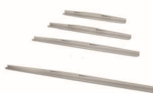
HUSQVARNA BV 30 SCREED BLADE 1.8/2.4/3.0/3.6/4.2m.