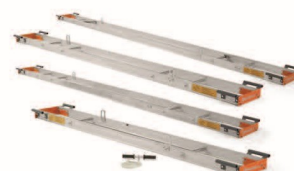
HUSQVARNA BD 32/42/52/62 3.2, 4.2, 5.2, 6.2m, 32–57kg.