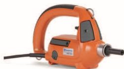
ELECTRIC-POWERED HUSQVARNA AME 600 1-phase, 0.6kW, 1.9kg.