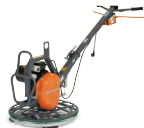
ELECTRIC-POWERED HUSQVARNA BG 245 E 1.5kW, 600mm, 60kg.