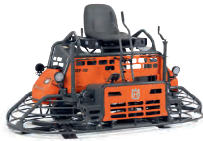
PETROL-POWERED HUSQVARNA CRT 48 Ideal for finishing surfaces 1000–1900 m 2 . Featuring a superior mechanical steering system and balanced power-to-weight ratio. 27.6kW, 2x1220 mm, 579kg.