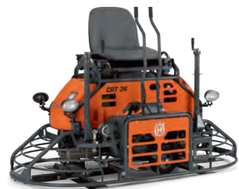
PETROL-POWERED HUSQVARNA CRT 36 Ideal for finishing surfaces 250–1000 m 2 . Featuring a superior mechanical steering system and balanced power-to-weight ratio. 16.5kW, 2x915 mm, 451kg.