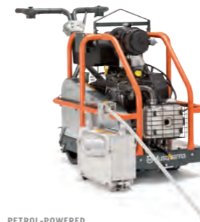
PETROL-POWERED HUSQVARNA SOFF-CUT 4000 Diamond blade max 350 mm, cutting depth max 70 mm, 191kg, 14.9kW*.