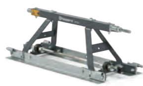
HUSQVARNA BT 90 G/E SCREED SECTION 0.5/0.75/1/2/3m.