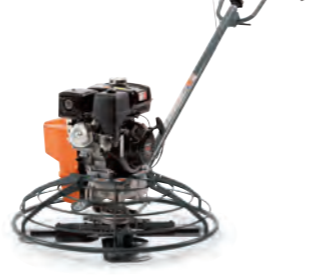
PETROL-POWERED HUSQVARNA CT 36 3.6–5.9kW, 875mm, 85–94kg.