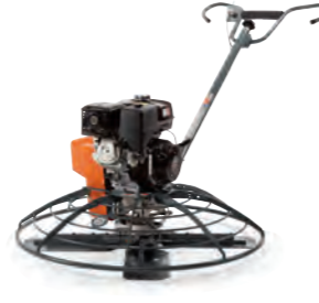
PETROL-POWERED HUSQVARNA CT 48 5.9–8.7kW, 1180mm, 105–125kg.