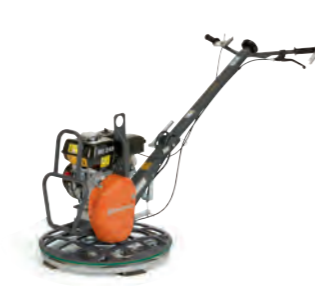
PETROL-POWERED HUSQVARNA BG 245 2.5kW, 600mm, 58kg.