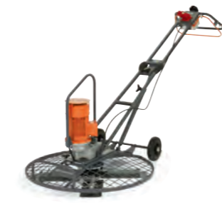
ELECTRIC-POWERED HUSQVARNA BG COMBI 1.8–2.4kW, 1020–850mm, 88–86kg.