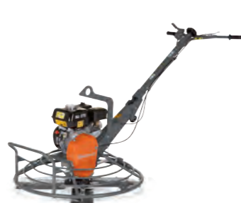
PETROL-POWERED HUSQVARNA BG 375 3.6–6.3kW, 900mm, 88–102kg.