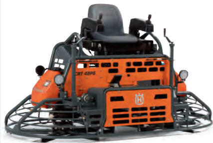
PETROL-POWERED HUSQVARNA CRT 48 PS Ideal for finishing surfaces 1000–2300 m 2 . The power steering enables accurate manoeuvring and virtually fatigue-free operation with two control modes to accommodate operator preference in varying site conditions. 42.5kW, 2x1220 mm, 660kg.