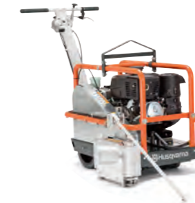
PETROL-POWERED HUSQVARNA SOFF-CUT 2000 Diamond blade max 250 mm, cutting depth max 38 mm, 144kg, 6.5kW*.