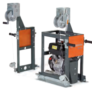
PETROL-POWERED HUSQVARNA BT 90 G 5kW, 20m, 93kg.