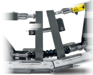
HUSQVARNA BT 90 CROWN INVERT BRACKET 267 mm, maximum angle 15°.