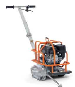
PETROL-POWERED HUSQVARNA SOFF-CUT 150 Diamond blade max 150 mm, cutting depth max 30 mm, 40kg, 3.5kW*.