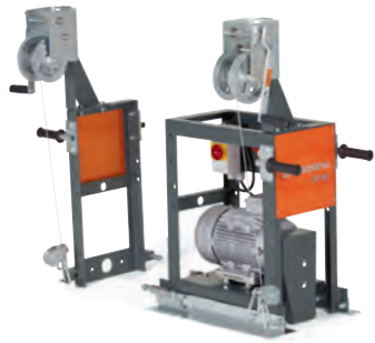
ELECTRIC-POWERED HUSQVARNA BT 90 E 3kW, 20m, 96kg.