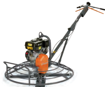
PETROL-POWERED HUSQVARNA BG 475 6.3kW, 1140mm, 105kg.