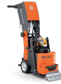
ELECTRIC-POWERED HUSQVARNA BS 110 1.5 kW, 230V/16A, 170 kg.