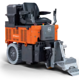
BATTERY-POWERED HUSQVARNA BMS 220ADB Ride-on, 4kW battery powered, 48V, 1142 kg.