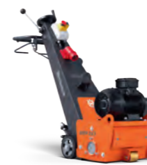
ELECTRIC-POWERED HUSQVARNA BMP 265 5.5 kW, 400V/16A, 265mm working width, 175 kg.