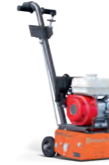
PETROL-POWERED HUSQVARNA BMP 215 PETROL 4kW, Petrol, 215mm working width, 59 kg.