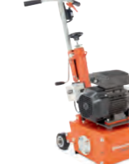
ELECTRIC-POWERED HUSQVARNA CG 200 2.2 kW, 220-240 V, grinding width 200 mm, 58 kg.