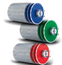
HUSQVARNA SHAVING TOOLS We offer different shaving blades for each individual machine and application.