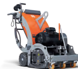
ELECTRIC-POWERED HUSQVARNA BMC 335RC Remote controlled, 16kW, 400V/63A, 335mm working width, 432 kg.