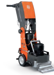
ELECTRIC-POWERED HUSQVARNA BS 75 1.5 kW, 230V/16A, 128 kg.