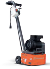
ELECTRIC-POWERED HUSQVARNA BMP 215 1.8 kW, 230V/16A, 215mm working width, 63 kg.