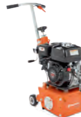
PETROL-POWERED HUSQVARNA CG 200 3.6 kW, Petrol, working width 200 mm, 54 kg.