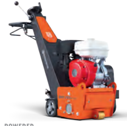
PETROL-POWERED HUSQVARNA BMP 265 PETROL 6kW, Petrol, 265mm working width, 190 kg.