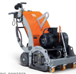
ELECTRIC-POWERED HUSQVARNA BMP 335 12 kW, 400V/32A, 335mm working width, 393 kg.