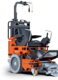
ELECTRIC-POWERED HUSQVARNA BMS 150 Ride-on, 2.2kW, 230V/16A, 480 kg.