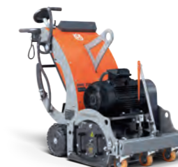
ELECTRIC-POWERED HUSQVARNA BMC 335 16 kW, 400V/32-63A, 335mm working width, 430 kg.