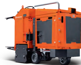
ELECTRIC-POWERED HUSQVARNA BMP 4000RC Remote controlled, 30kW, 400V/63A, 380mm working width, 1550 kg.