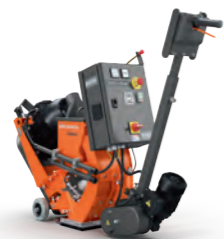
ELECTRIC-POWERED HUSQVARNA BLASTRAC 1-8DPS55 5.5kW, 400V, 16A, working speed 0.5–23m/min, working width 203mm, 154kg.