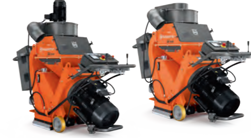
HYDRAULIC-POWERED HUSQVARNA BLASTRAC EBE 500S (50/60Hz) 22kW, 400V, 63A, working speed 1–30m/min, working width 500mm, 752kg.