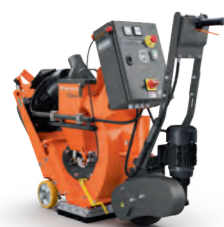
ELECTRIC-POWERED HUSQVARNA BLASTRAC 1-10DPS75 7.5kW, 400V, 16A, working speed 0.5–30m/min, working width 254mm, 211kg.