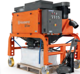
ELECTRIC-POWERED HUSQVARNA BLASTRAC DC 2-48 18kW, 400V, 32A, 1107kg.