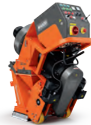
ELECTRIC-POWERED HUSQVARNA BLASTRAC EBE 350 11kW, 400V, 32A, working speed 1–15m/min, working width 350mm, 430kg.