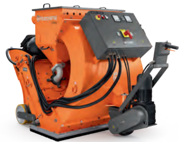
ELECTRIC-POWERED HUSQVARNA BLASTRAC 2-48DS 2×22kW, 400V, 125A, working speed 0.5–33m/min, working width 1220mm, 1350kg.