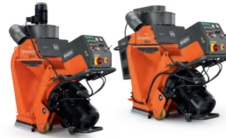
ELECTRIC-POWERED HUSQVARNA BLASTRAC EBE 500 (50/60Hz) 22kW, 400V, 63A, working speed 1–15m/min, working width 500mm, 742kg.