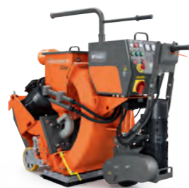
ELECTRIC-POWERED HUSQVARNA BLASTRAC 2-20DT 2×11kW, 400V, 63A, working speed 0.5–33m/min, working width 550mm, 575kg.