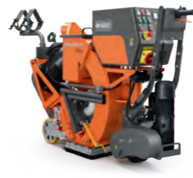
ELECTRIC-POWERED HUSQVARNA BLASTRAC 1-10DS 11kW, 400V, 32/63A, working speed 0.5–25m/min, working width 254mm, 395kg.