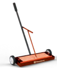
HUSQVARNA MAGNETIC SWEEPER