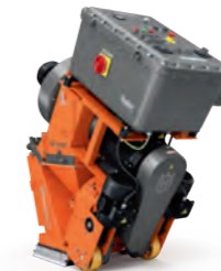
ELECTRIC-POWERED HUSQVARNA BLASTRAC EBE 350EX 11kW, 400V, 32A, working speed 1–15m/min, working width 350mm, 450kg.