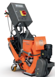
ELECTRIC-POWERED HUSQVARNA BLASTRAC 1-8DPF40 4kW, 400V, 16A, working speed 0.5–23m/min, working width 203mm, 122kg.