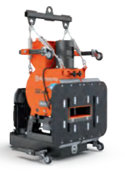
ELECTRIC-POWERED HUSQVARNA BLASTRAC EBE 200V 7.5kW, 400V, 32A, working speed 0.2–20m/min, working width 217mm, 177kg.