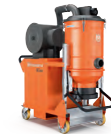
ELECTRIC-POWERED HUSQVARNA BLASTRAC DC 200 13kW, 400V, 30A, 360kg.