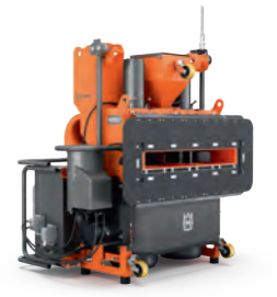
ELECTRIC-POWERED HUSQVARNA BLASTRAC EBE 900V 2×22kW, 400V, 125A, working speed 0.5–10m/min, working width 890mm, 880kg.