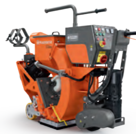
ELECTRIC-POWERED HUSQVARNA BLASTRAC 1-15DS 15kW, 400V, 63A, working speed 0.5–25m/min, working width 380mm, 450kg.