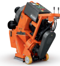
HYDRAULIC-POWERED HUSQVARNA BLASTRAC EBE 350S 11kW, 400V, 32A, working speed 1–30m/min, working width 350mm, 415kg.