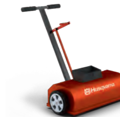
HUSQVARNA MAGNETIC BROOM R900