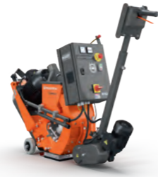
ELECTRIC-POWERED HUSQVARNA BLASTRAC 1-8DPS30 3kW, 230–400V, 16A, working speed 0.5–23m/min, working width 203mm, 125kg.