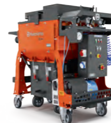
ELECTRIC-POWERED HUSQVARNA BLASTRAC DC 975 7.5kW, 400V, 63A, 510kg.