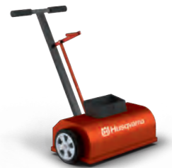
HUSQVARNA MAGNETIC BROOM R600