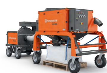
ELECTRIC-POWERED HUSQVARNA BLASTRAC DC 900 17kW, 400V, 32A, 860kg.