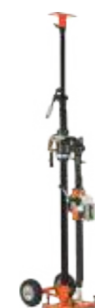
HUSQVARNA DS 50 GYRO Ø 350 mm, travel length 670 mm, 56 kg.