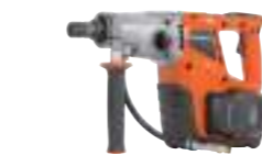
BATTERY-POWERED HUSQVARNA DM 540i 1350W, recommended drill diameter 15–75 mm (100 mm with drill stand), 4.9kg. BLi 36 V battery system.