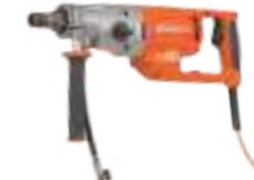
ELECTRIC-POWERED HUSQVARNA DM 200 2000W, 1-phase, recommended drill diameter 25–100 mm, 6.4 kg.