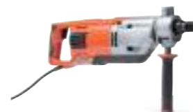
ELECTRIC-POWERED HUSQVARNA DM 220 1850W, 1-phase, recommended drill diameter 150 mm, handheld 80 mm, 7.5 kg.