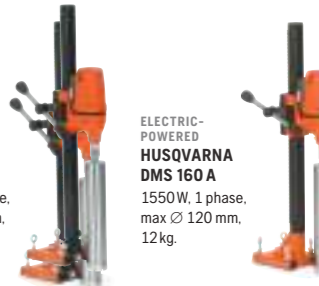
ELECTRIC-POWERED HUSQVARNA DMS 160 A 1550W, 1 phase, max Ø 120 mm, 12 kg.