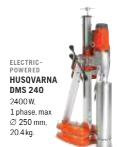
ELECTRIC-POWERED HUSQVARNA DMS 240 2400W, 1 phase, max Ø 250 mm, 20.4 kg.