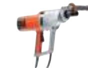
ELECTRIC-POWERED HUSQVARNA DM 230 1850W, 1-phase, recommended drill diameter 150 mm, handheld 80 mm, 7 kg.