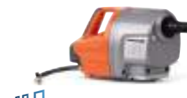
PRIME ELECTRIC-POWERED HUSQVARNA DM 700 6000/3000W, 3-phase/1-phase, recommended drill diameter 80–600 mm, 14 kg.